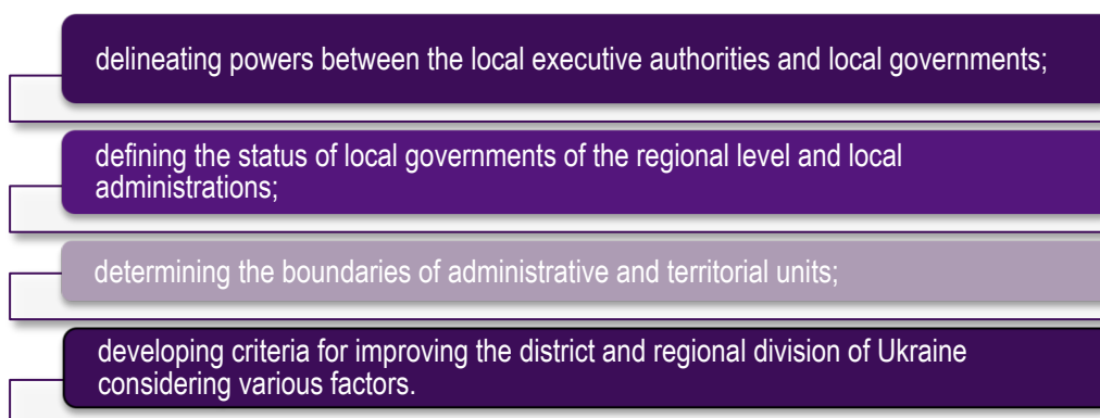
Figure 1. Directions of administrative-territorial reform in Ukraine

The main directions of the administrative-territorial reform are developed by the Ukrainian government. In September, 2014 the President of Ukraine presented the Ukraine-2020 Strategy for Sustainable Development (Decree 5/2015, 2015). This document contains the list of 62 necessary reforms, as well as 25 key performance indicators, including the directions of the administrative-territorial reform (see Figure 1).